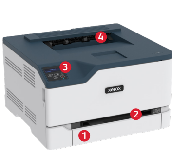
Xerox® C230 Colour Printer