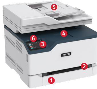
Xerox® C235 Colour Multifunction Printer.