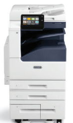
Xerox® VersaLink® C7020/C7025/C7030 Color Multifunction Printer