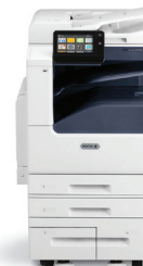
Xerox® VersaLink® B7025/B7030/B7035 Multifunction Printer