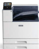
Xerox® VersaLink® C8000 Color Printer