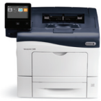
Xerox® VersaLink® C400 Color Printer