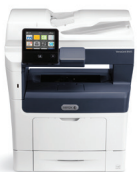
Xerox® VersaLink® B405 Multifunction Printer