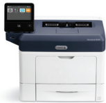
Xerox® VersaLink® B400 Printer